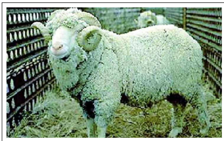
Fig.1. The Booroola merino, which came to prominence in Australia for its high prolificacy, with many multiple births recorded and an average of 2.6 lambs per litter. The gene for prolificacy was traced back to the Garole sheep from West Bengal