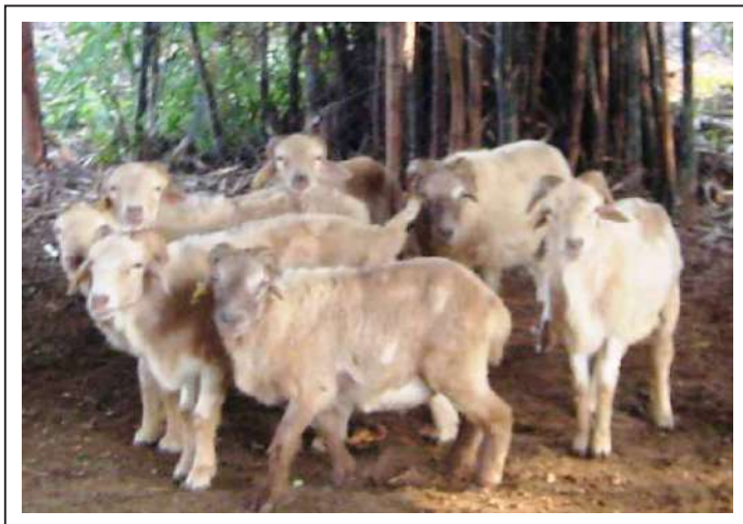
Fig. 4. Garole rams at NARI