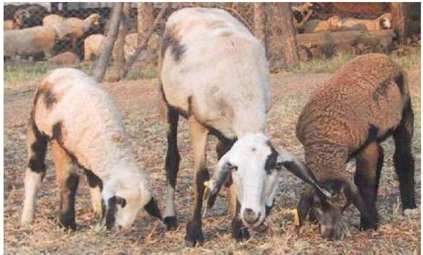
Fig. 7. A FecB gene carrier NARI Suwarna ewe with twin lambs