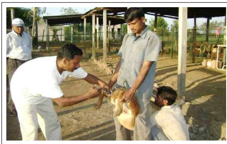
Fig. 2. Artificial insemination in ewes on NARI's farm using fresh, diluted ram semen

Matings were also carried out to demonstrate segregation of a postulated single major gene for prolificacy in the Garole breed (Nimbkar et al. , 2002). B+ F1 Garole cross rams were mated to Deccani ewes and the ovulation rate of the resulting ¼ Garole ewes was measured. If the Garole prolificacy was due to a single gene, half the ewes would be expected to inherit one prolificacy allele of the gene from the