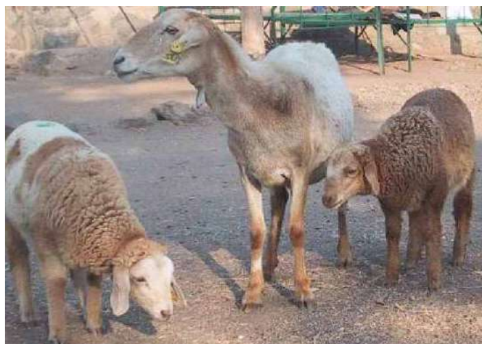
Fig. 8. A FecB gene carrier NARI Composite ewe with twin lambs