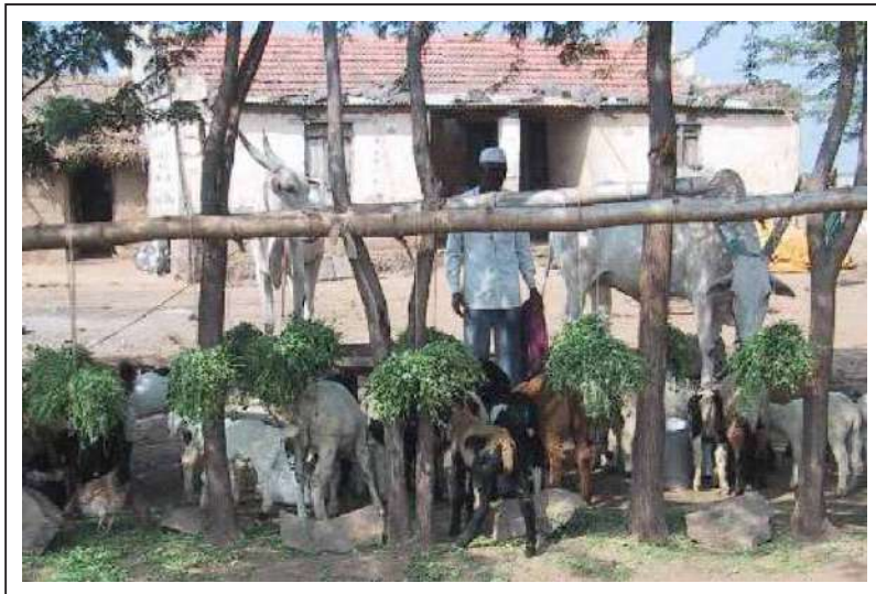
Fig. Shepherds feed Lucerne to lambs for fast growth