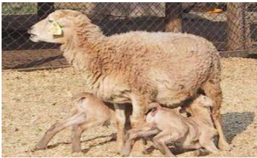
Fig. 6. A Garole ewe with its twin lambs