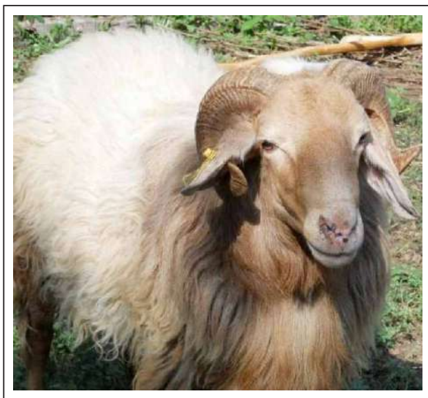
Fig. 5. Awassi ram at NARI

From 2003 onwards, the focus was on developing two prolific strains, the fecund Deccani (later named the NARI Suwarna) and the fecund Composite (later named the NARI Composite) with the attributes of high fertility and prolificacy, good lamb rearing ability and fast growth . The NARI Suwarna was to have up to 25% Garole proportion with the remaining proportion being Deccani. The NARI Composite was to have up to 25% Awassi and/or Bannur genes, <25% Garole genes and the remaining Deccani. The objective was to generate BB, B+ and ++ ewes of both the NARI Suwarna and Composite breeds for testing in shepherds' flocks. The mate selection approach (Kinghorn et al. , 2002) was used for allotting rams to ewes using the Total Genetic Resource Management Program (TGRM™) (X'Prime Pty Ltd., 2005). An index of Estimated Breeding Values (EBV) for reproductive and weight traits was used. The ratio of index weights on the different traits was 1:4:12 for fertility, 3 months weight and live litter size at birth respectively. This was based on economic values for a breeding objective calculated by Nimbkar (2006) for the animals in this introgression program.