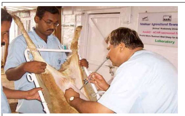
Fig. 3. Laparoscopy to measure ovulation rate in ewes at NARI.

After the confirmation of the existence of the FecB mutation in the Garole, the PCR-RFLP DNA test to identify the mutation (Wilson et al. , 2001) was established in 2002 at the National Chemical Laboratory (NCL) in Pune, India. All crossbred progeny produced in the breeding program thereafter were genotyped for the FecB locus using this test. Deccani and Bannur animals and their crosses were not routinely genotyped for FecB because they are not prolific and are unlikely to carry the FecB mutation. This was confirmed by genotyping a number of sheep of these two breeds (Pardeshi et al. , 2005).